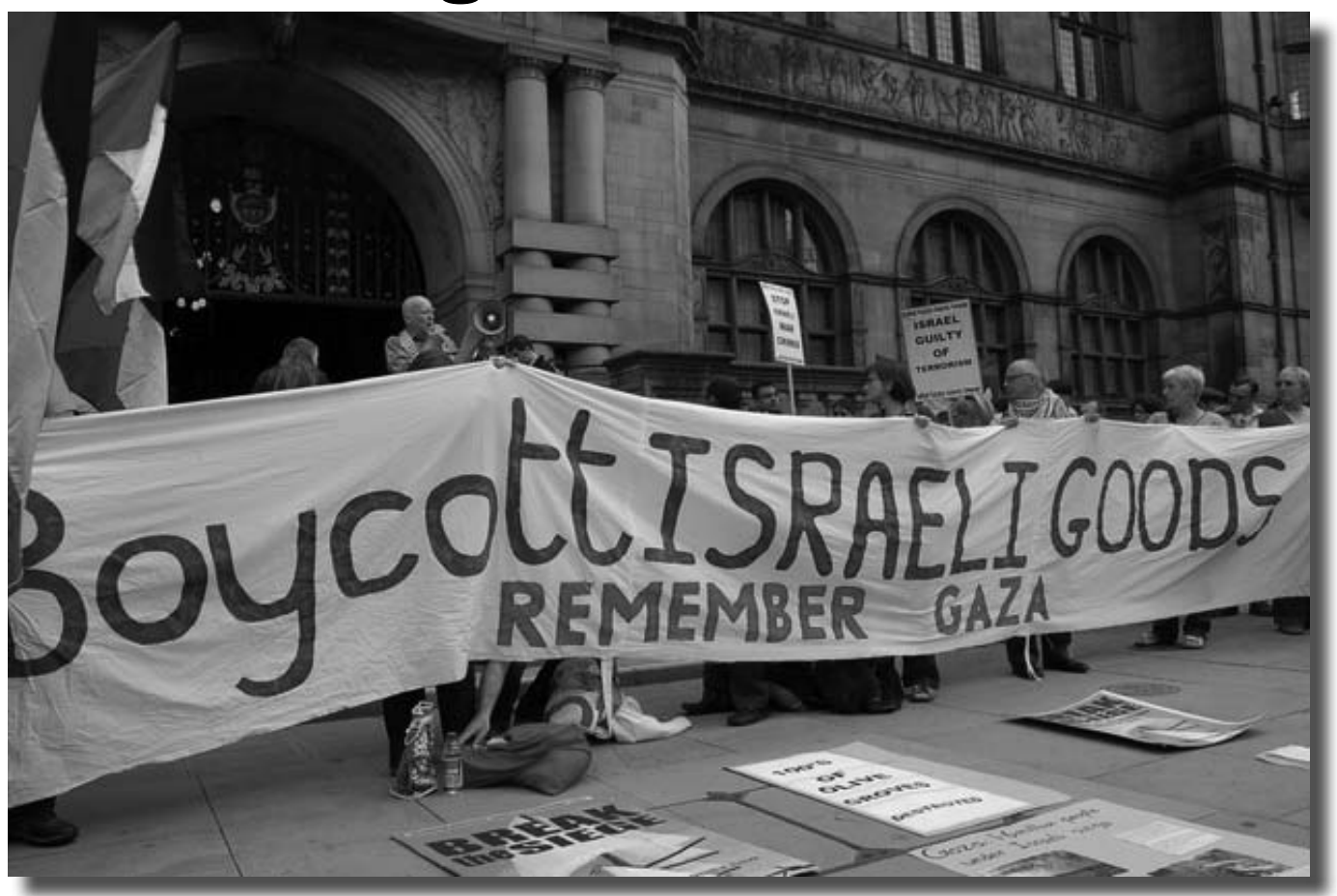
Protesters assemble in front of the town hall

As you are probably well aware by now, the state of Israel recently caused a fresh international outcry. In the early morning of 31st May Israeli commandos stormed aid ships which were on their way to the Israeli-besieged state of Gaza to provide essential humanitarian relief to the desperate civilian population who are trapped there. We now know that nine activists were shot dead by the Israeli commandos, including possibly some as they slept.