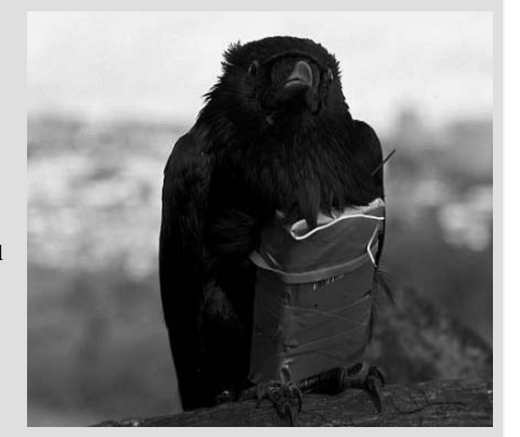
the opinions of millions. So don't take my word for it. See it and make your own mind up.

I am not sure what I expected of 'Four Lions' but I was not disappointed. It is hilarious. Some of the laughs are drawn from the aspiring terrorists' ineptitude, which had a distinctly Ealing comedies flavour. Carry On Jihad if you will. This does not detract from the subject matter, which is at times incredibly scary. I have never found a Weetabix so threatening in my life. Its emphasis on the virtue of letting people think for themselves is admirable in a culture saturated with party politics and religion trying to compartmentalise