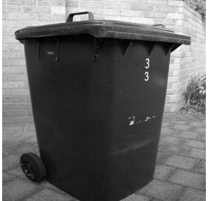
We know where we'll be keeping our general election manifestos.

AFed National: http://www.afed.org.uk Email: info@afed.org.uk BM ANARFED, London, WC1N 3XX, UK