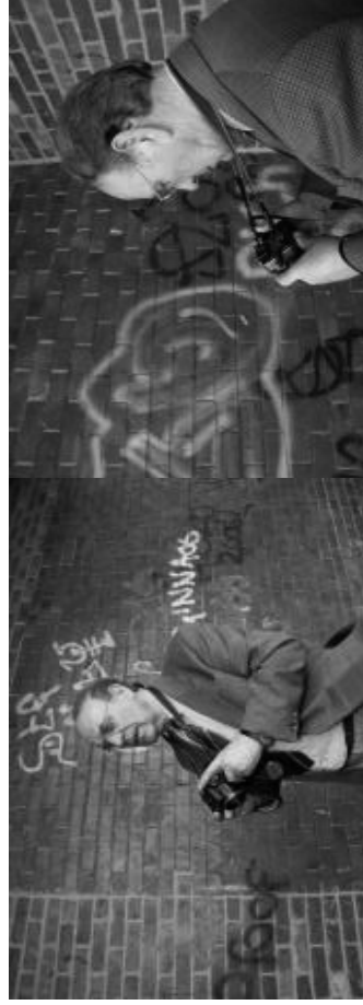
Lib Dem community activists admire artwork provided by local youth.

But what do they actually have to say for themselves? One of their biggest boasts is that they've spent nearly half a million pounds on 15 extra Police Community Support Officers. You can debate whether or not more cops are a good investment, but it's hard to deny that PCSOs are utterly useless - they're not even real cops, they can't join the Police Federation, and can only make citizen's arrests the same as anyone else, they're not trusted enough to carry batons or CS spray, and South Yorkshire ones don't even have handcuffs. But they are allowed to carry rubber gloves. Basically, they're no different from anyone else having a stroll around the place, except the Lib Dems are paying half a million quid for 15 of them. They're not