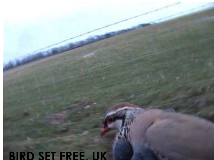
BIRD SET FREE, UK