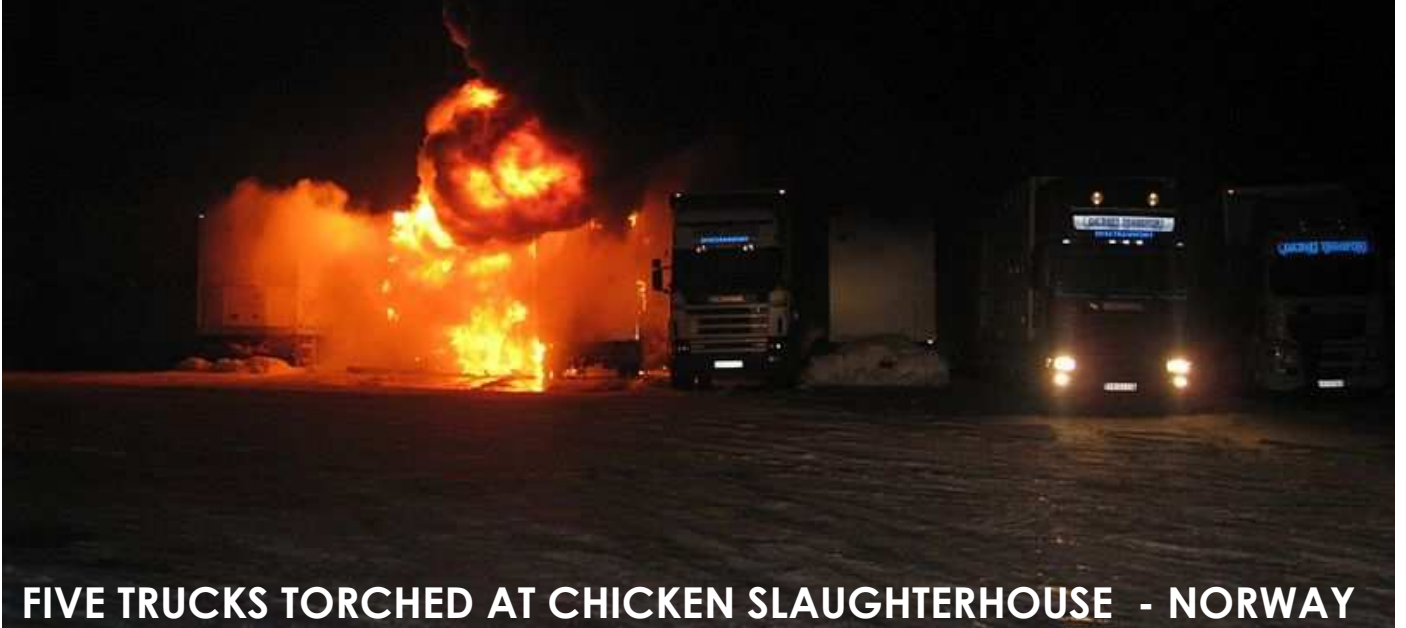
FIVE TRUCKS TORCHED AT CHICKEN SLAUGHTERHOUSE - NORWAY