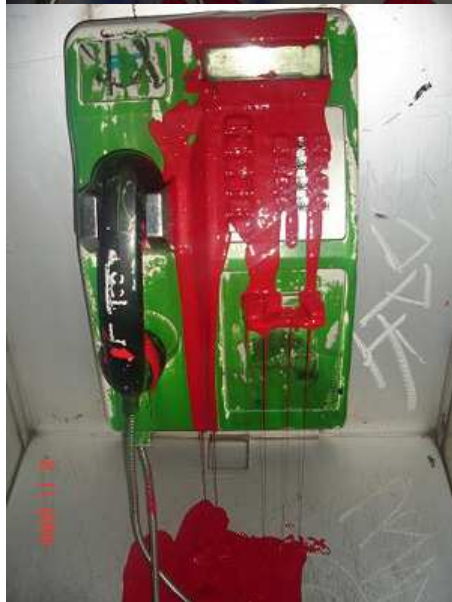
mexico city november 9, 2008 *