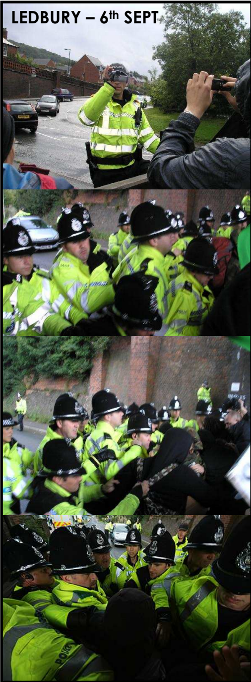
LEDBURY – 6 th SEPT

www.indymedia.org.uk/en/actions/2008/sequani/