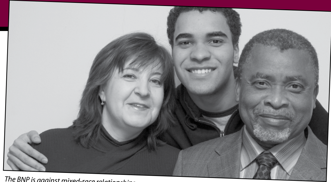
The BNP is against mixed-race relationships

■ A Channel 5 documentary showed how the BNP receives money from the sale of neo-Nazi music and fundraiser events.