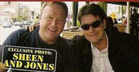
Brothers in arms: Alex Jones with actor and fellow 9/11 Truth activist Charlie Sheen.