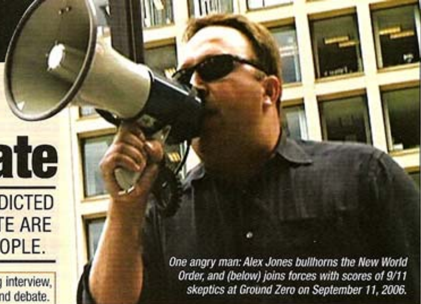
One angry man: Alex Jones bullhorns the New World Order, and (below) joins forces with scores of 9/11 skeptics at Ground Zero on September 11, 2006.

We talked with the fiery Texan about why 9/11 can be seen as the "foundational event" of the New World Order and what the global elite has in store for the American people.