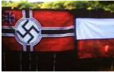
Polish flag at his camp was placed next to the Neo-Nazi flag.

The people on the camp were singing their favorite song: " National Socialism- the only right way for the country! " National Socialism's abbreviation is Nazism. They were also shouting: Hail Hitler! Go and listen to it!