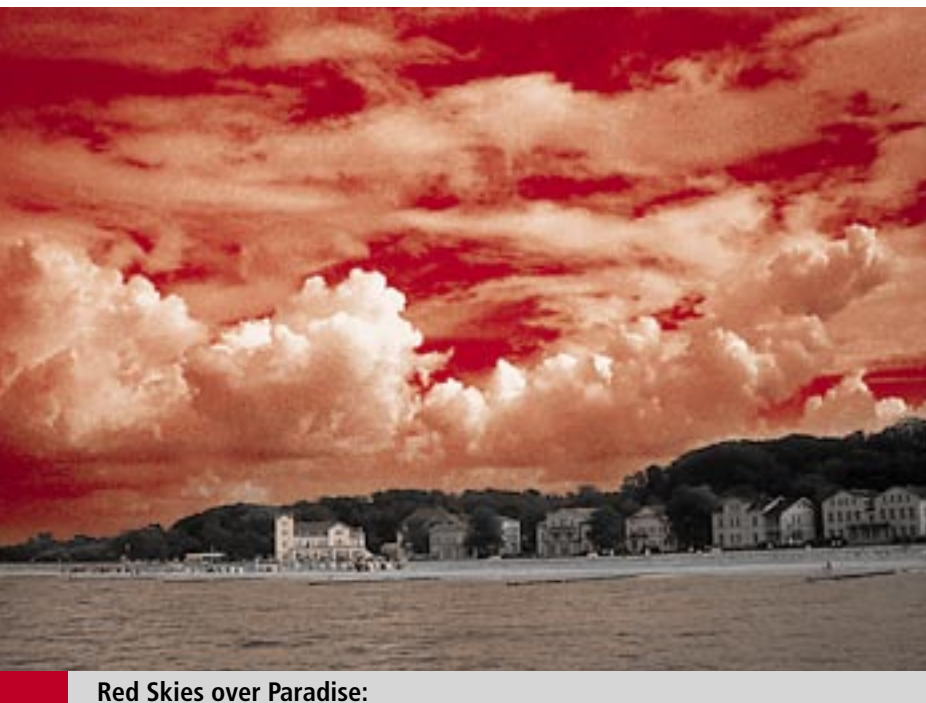
Red Skies over Paradise: Heiligendamm 2006, the Health Spa and Kempinski Grand Hotel.

In this sense, Seattle and Genoa have not fully arrived yet. In this sense, their promise remains a line on the horizon. In this sense, the movement of movements has yet to begin. The G8 summit that will take place in June 2007 on the coast of the Baltic Sea near Rostock is the next opportunity. It is our opportunity. Not only right there and right then, but as of now, everywhere, and far beyond Heiligendamm.