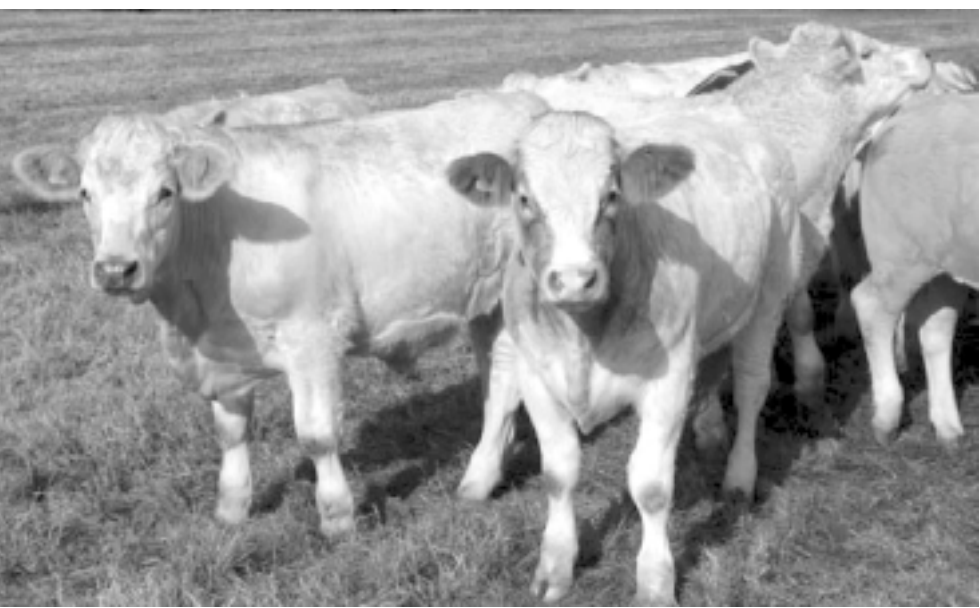
Cattle: actually quite different from asylum seekers

The chief scientist involved in the experiment was yesterday found dead under mysterious circumstances.