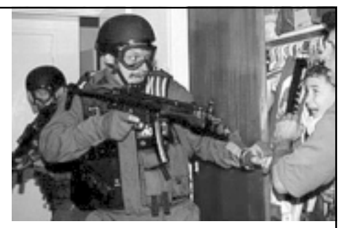
will. Still, even then I thought they were just putting it on. Like parrots."

"Now I come to think of it there were loads of clues. Like when they wept when families were separated, attempted suicide when we tried to remove them - all of which would suggest a degree of feeling and free