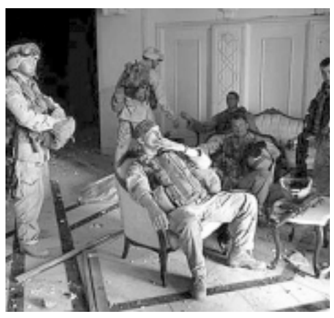
Luxury in downtown Bagdad

To be honest I didn't know what to expect when my editor suggested writing an article on holidaying in Iraq. Images of evil dictators and weapons of mass destruction means Iraq isn't everybody's idea of a relaxing mini-break! But never one to pass up a chance of a free trip abroad, on arrival