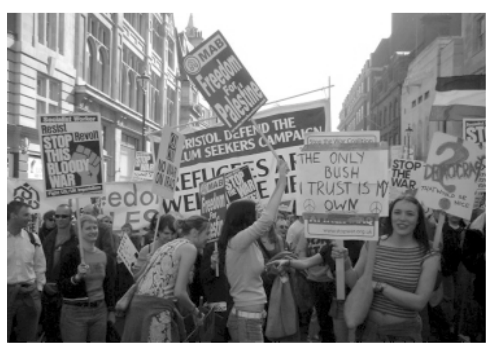
Commies, students, the unemployed, bleeding heart liberals, do-gooders etc...

To protect our freedom to protest we must first restrict our freedom to protest proclaims police chief