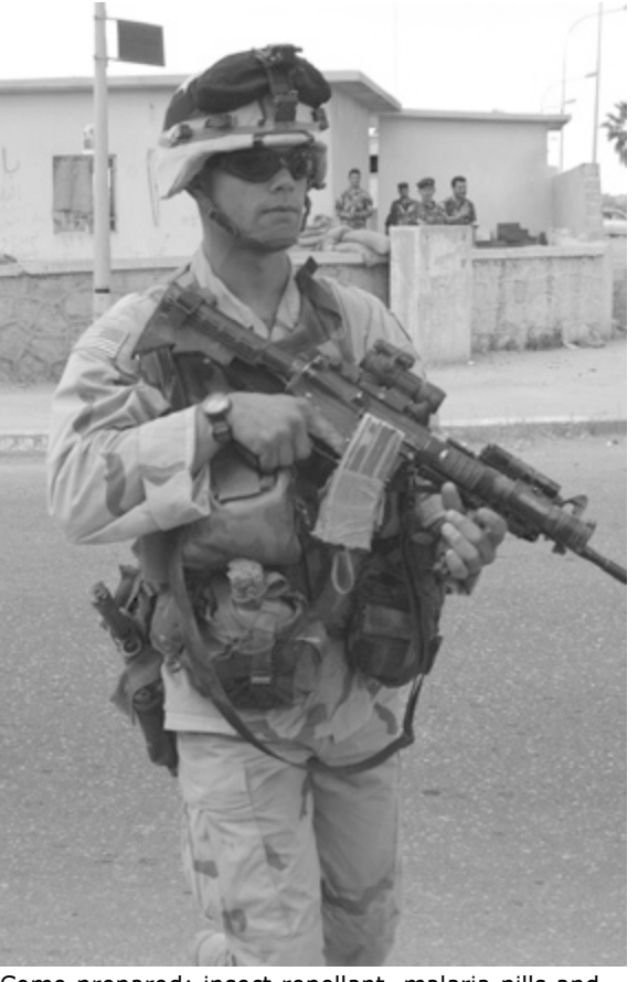
Come prepared: insect repellant, malaria pills and an M16 are essential

All in all I was very sad to be on the plane home. Iraq – a beautiful, historic country. May it never change.