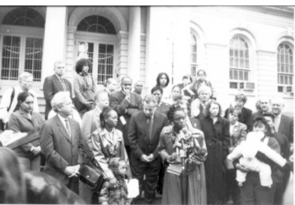
Look: they even look like freaks

The torrent of filth continued as a group spokesperson suggested that if the $800 m spent annually on arms around the globe was targeted elsewhere the world could eliminate hunger, preventable disease and poverty. Commenting on the group's statements, Home