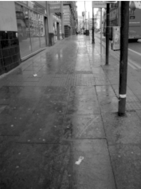
For sale! Pavements up for grab

LONDON – Embattled Defence Secretary Geoff Hoon last night came under global criticism from human rights campaigners over controversial new plans to privatise Britain's pavements in an effort to raise money for the continuing war effort in Iraq. Mr Hoon is thought to have been instrumental in