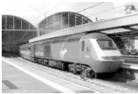
The B345 London to Glasgow train: a record 465 days late, passengers resorted to cannibalism

Transport Minister Alistair Darling also faces an Anti Social Behaviour Order as a measure to protect residents of a number of cities whom he has openly harassed and threatened. For some time, Mr Darling has been terrorising neighbourhoods around major airports with threats to 'make their lives hell'. He has been promising to afflict