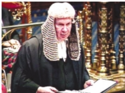
Judge: and be judged