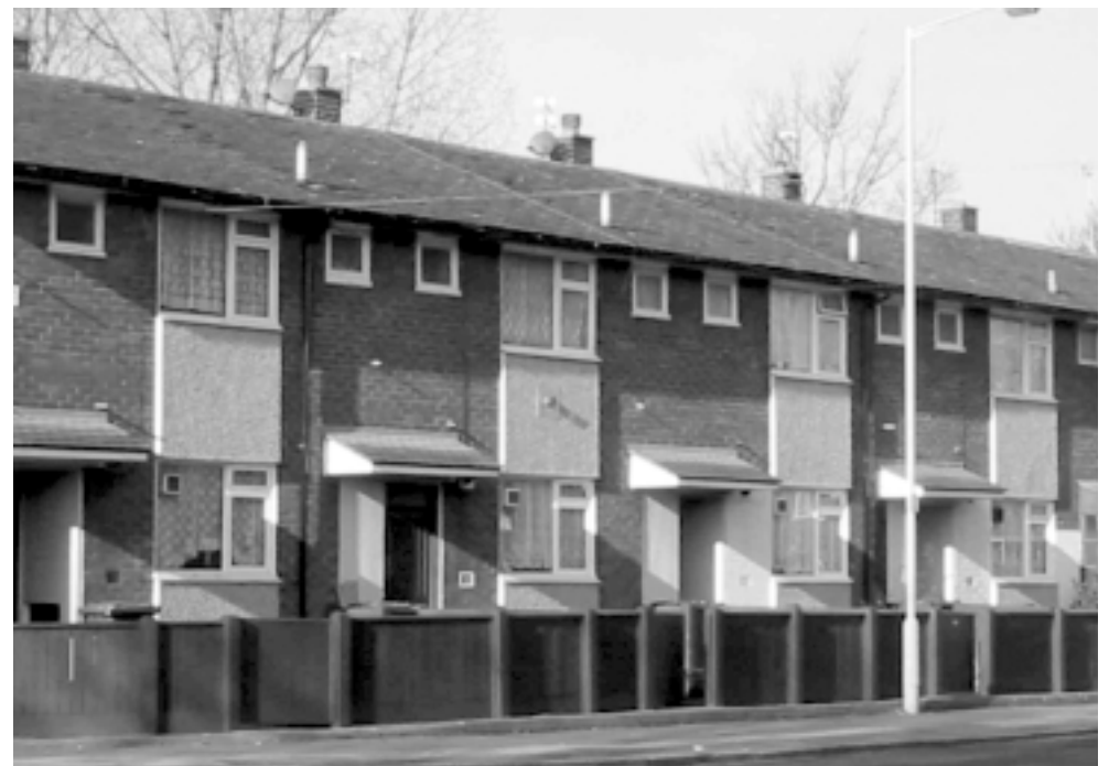
Scum: them on that estate are all the same you know

Although the Local Authority had sent many