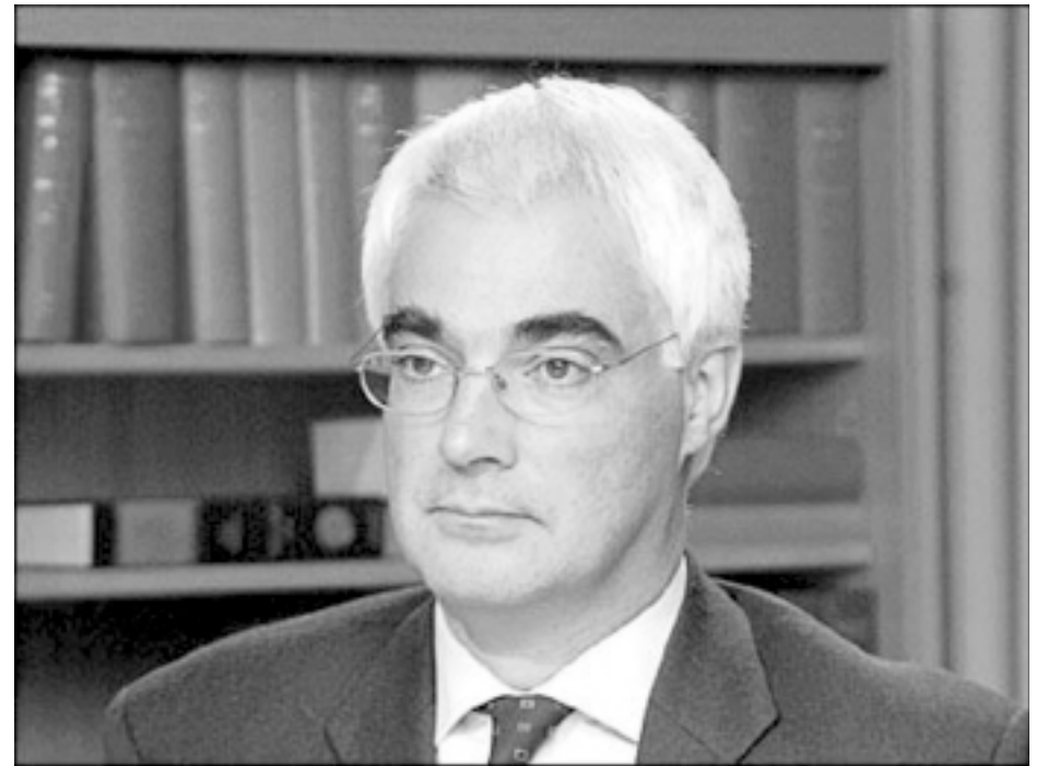
Darling: not now, I have a headache

Some residents have attempted to address Mr Darling's behaviour without resorting to legal action by offering alternatives to his addiction, like a decent rail service. The real slap in the face came when it emerged that Darling had been